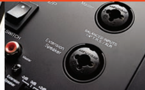
XLR, 1/4" and RCA Inputs