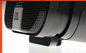
Snap-On Angle Pedestals