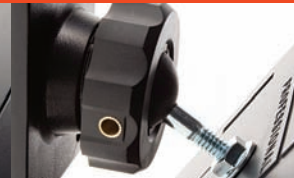
Optional Mounting Kit**