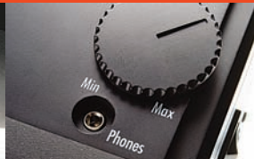
Volume Control and Phones Output